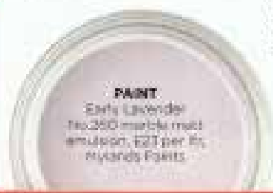
PAINT Earls Lavender, 1kg/250ml matt emulsion, £21 per lit, Mylands Paints

Mix and match styles and colours for a characterful home, like Lotta Cole's