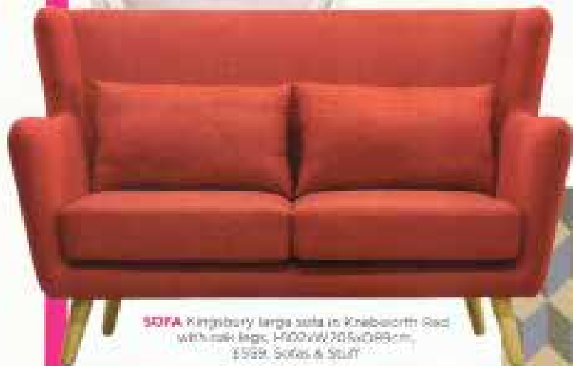
SOFA Kingsbury large sofa in Knibsworth Red with oak legs, H60xW170xL188cm, £599, Sofas & Stuff