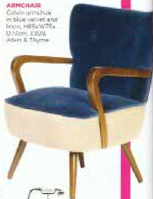
ARMCHAIR Colvin armchair in blue velvet and linen, H85xW75x D77cm, £204, Adin & Thyme