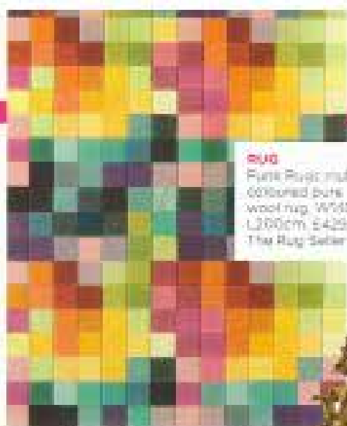
RUG Funt Funt multi-colored patchwork wool rug, W110x L200cm, £429, The Rug Seller