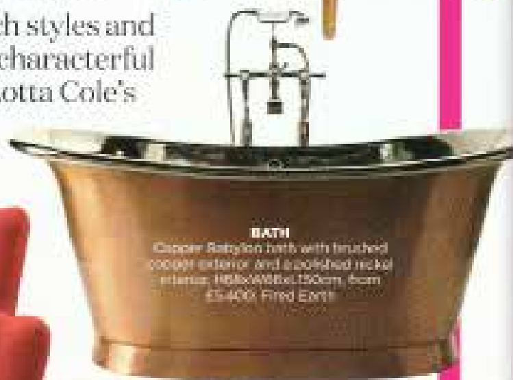
BATH Copper Babylon bath with finished copper exterior and polished metal interior, H65xW108x L150cm, 6cm £5499, Fired Earth