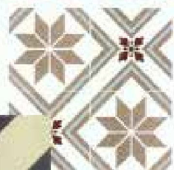
TILES Top Fennace Tile, L66xW45cm, £16.95 per m 2 , Walls & Floors Left Doysey Devile light/bleu blue on Dover White, W15x L15cm, £204.95 per m 2 , Original Style