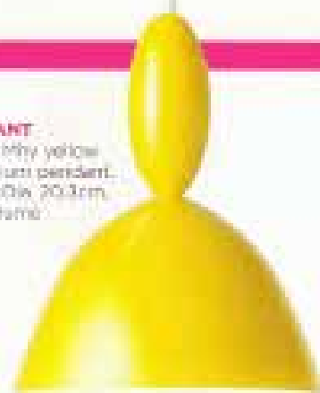
PENDANT Husto/Hny yellow aluminium pendant, H26xW16x D20.3cm, £65, Home