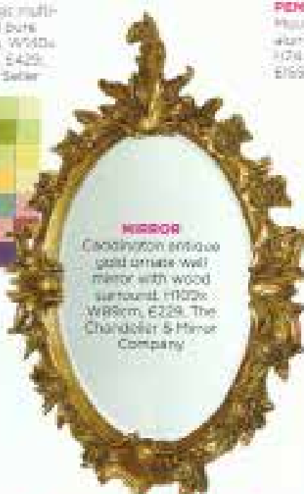
MIRROR Cradington antique gold ornate wall mirror with wood surround, H102x W95cm, £329, The Chandelier & Mirror Company